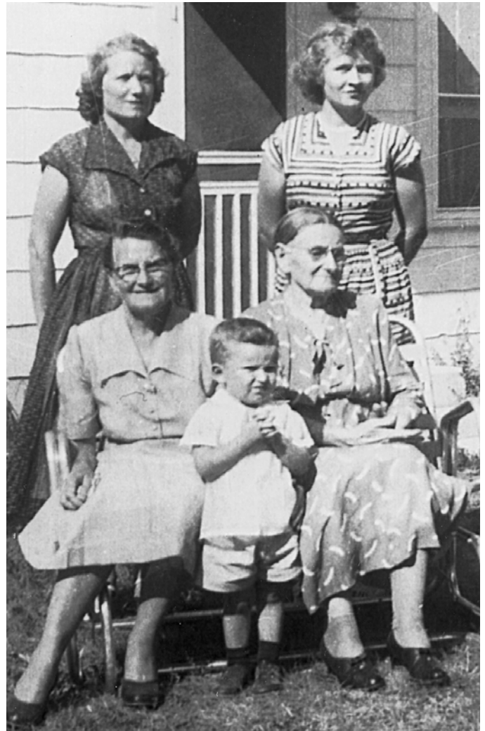
Five Generations — ca 1953