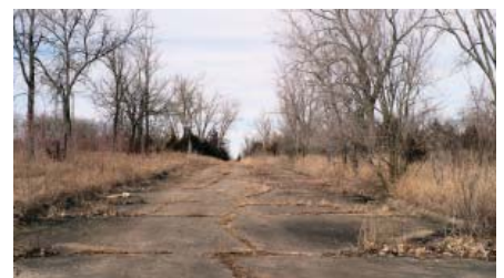
Above, a former Sunflower, KS, street crumbles.